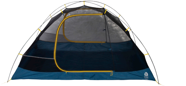
Tent Lite Hook

STEP 3: Connect Tent Lite hooks to poles