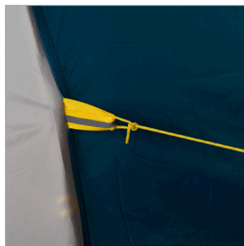
Tie the end of the guyline to the reflective guy out loop on your tent.