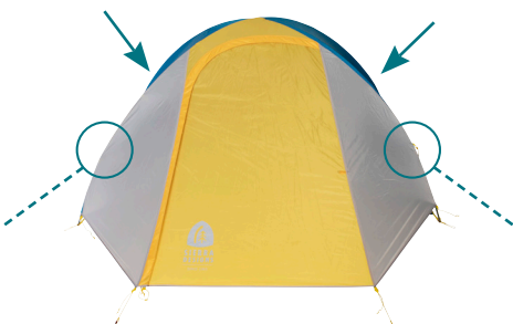
Stake out the end of the guy lines into the ground.

Guy out your tent in the 4 locations shown below to prevent pole rotation/breakage during high winds.