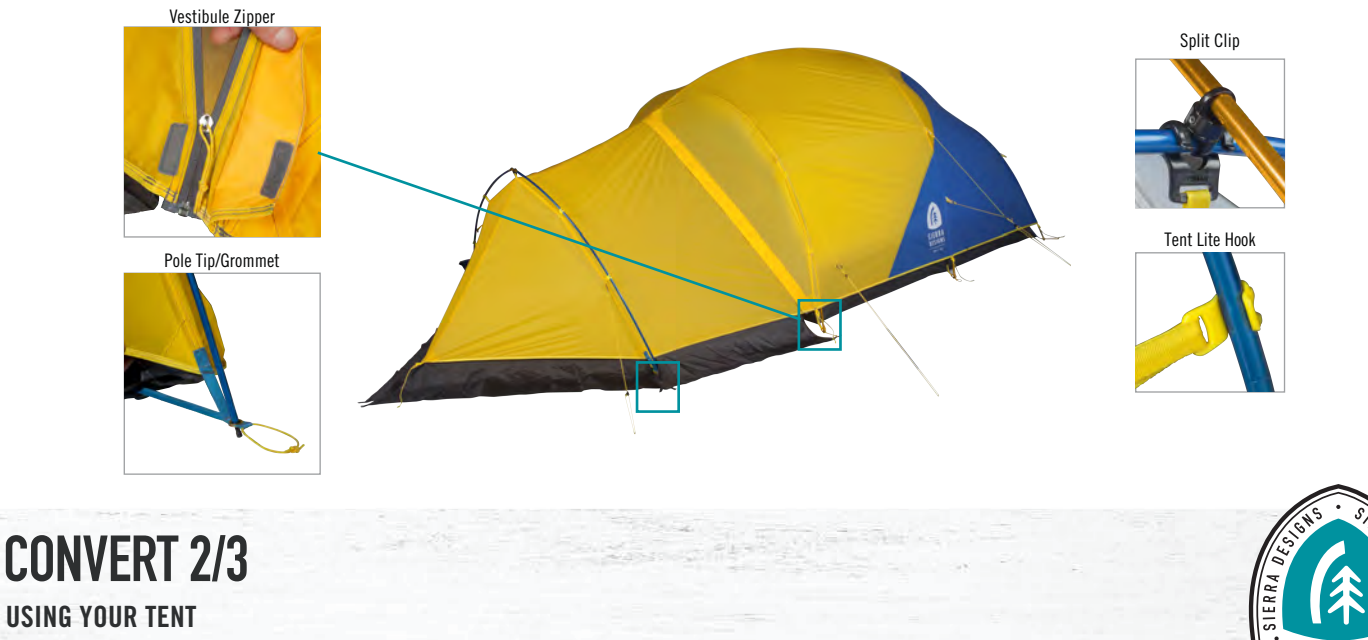
GUYING OUT YOUR TENT: Your tent includes attached guylines and stakes. It is good practice to always guy out your tent, but is absolutely necessary when it's windy.

STEP 7: The Convert tents feature a removable vestibule. To attach, zip the end of the vestibule to the zipper track on the right side of the tent door. Assemble blue pole and insert pole tip in grommets with blue webbing. Connect Tent Lite and Split Clips to pole. Stake out the vestibule end/sides and your tent is completely set up.